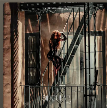
I'm Fakin Sabrina Carpenter

New York Times is emails I can't send - This delegate is unhinged and says things we all think of but never say.